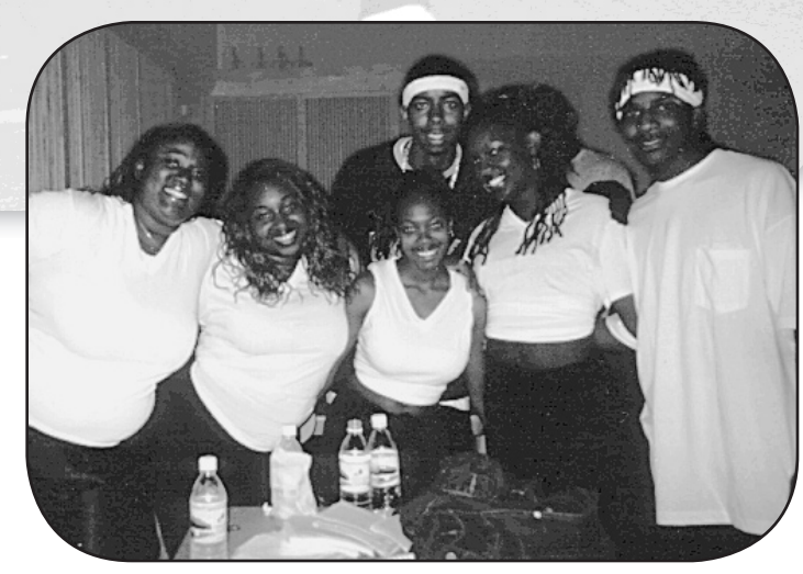
Demolishion Dance Squad

The squad is looking for additional members, so on December 4<sup>th</sup> and 5<sup>th</sup> there will be tryout rehearsals for anyone who is interested. During these rehearsals anyone trying out will learn a routine and perform it. So if you think that being on a Hip-Hop dance squad is something that you want to add to your HSU experience, then make sure to contact us at Demolishiondance@yahoo.com. HSU can look forward to many more performances this year from Demolishion.