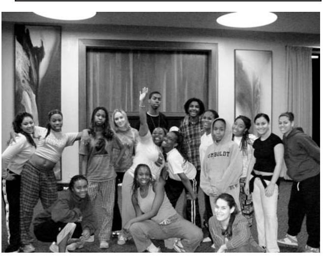
Demolishion Dance Squad- The New Squad!

Last October, Demolishion Dance Squad added 11 new members after a rigorous tryout week. Each member learned and performed three routines in a week and was evaluated based on their performance. Practices are held on Mondays and Wednesdays from 8PM-10PM in Goodwin Forum. The team has a few performances lined up for this upcoming semester. Watch for Demolishion on the quad and at basketball games.