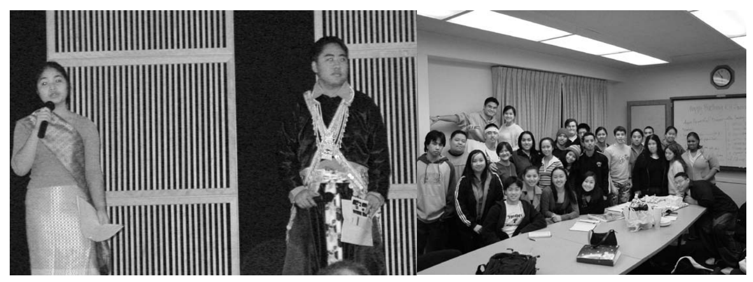
APASA finishes organizing the Asian Purposeful Dinner.