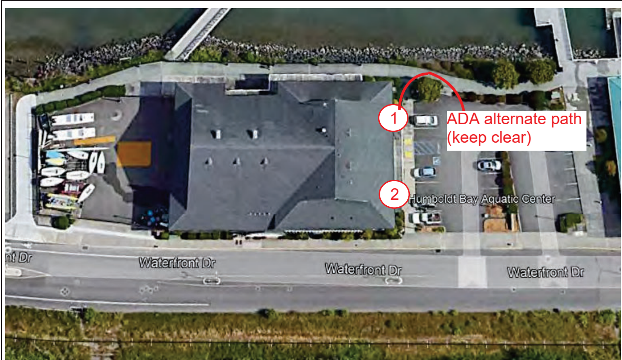
HBAC - Employee Access to be Preserved