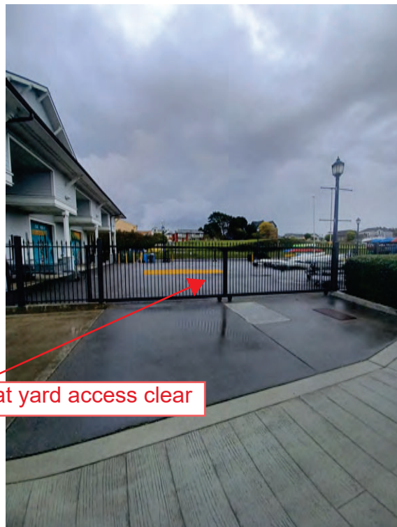
Access to Boat Yard