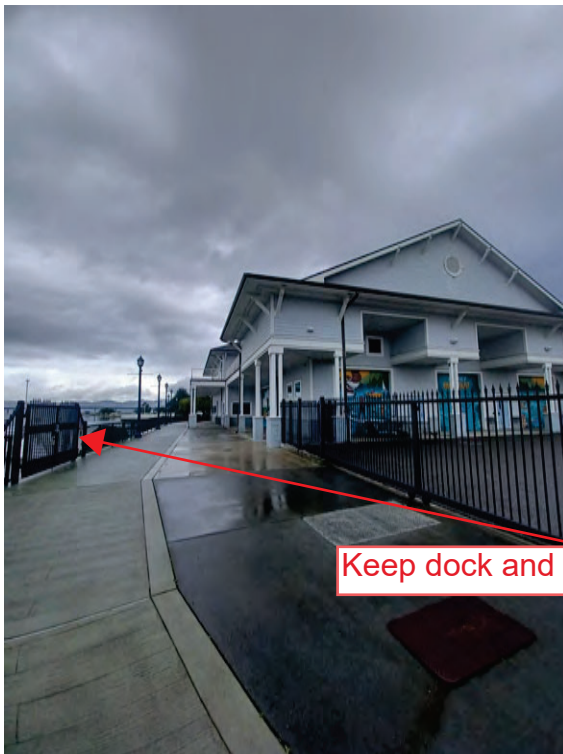
Access to Dock