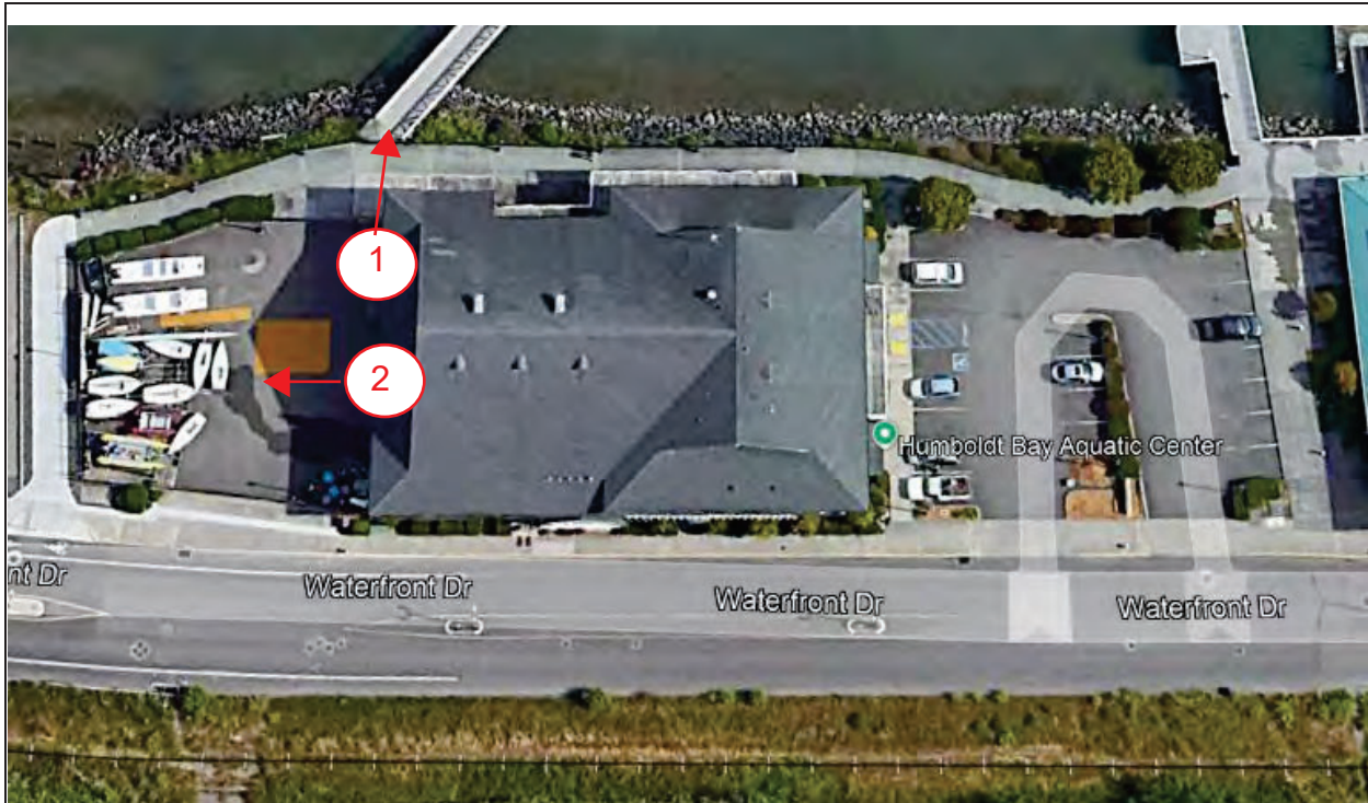
HBAC – Access to be Preserved