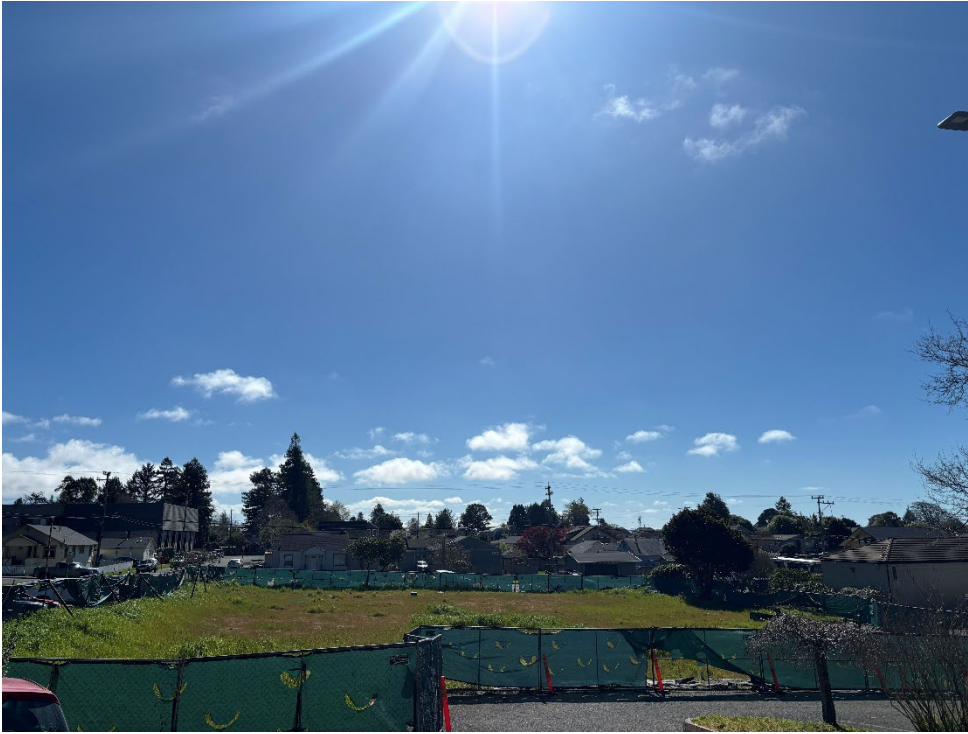
Photograph 1 – G14 vacant lot – view looking south