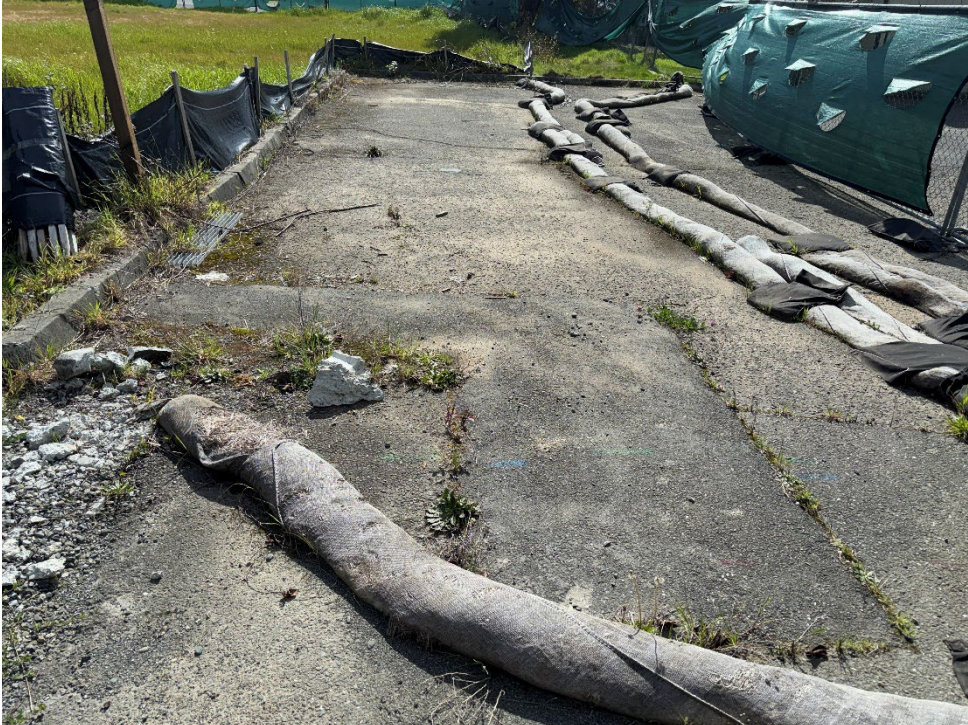
Photograph 3 – G14 at Marcom parking area – view looking south