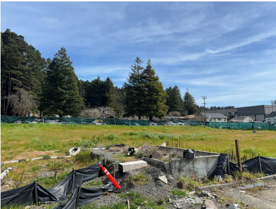
Photograph 2 – G14 vacant lot (former Children's Center building foundation) – view looking east