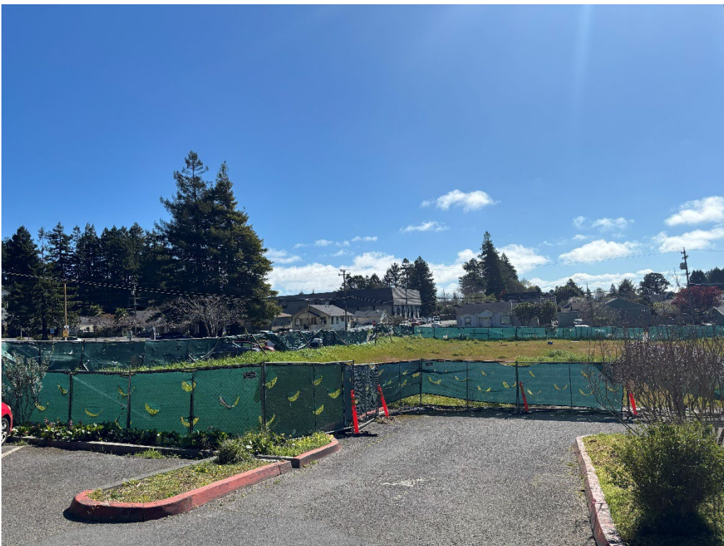
Photograph 8 – G14 drive lane and stalls north of vacant lot – red paint (typical) contains lead – view looking south