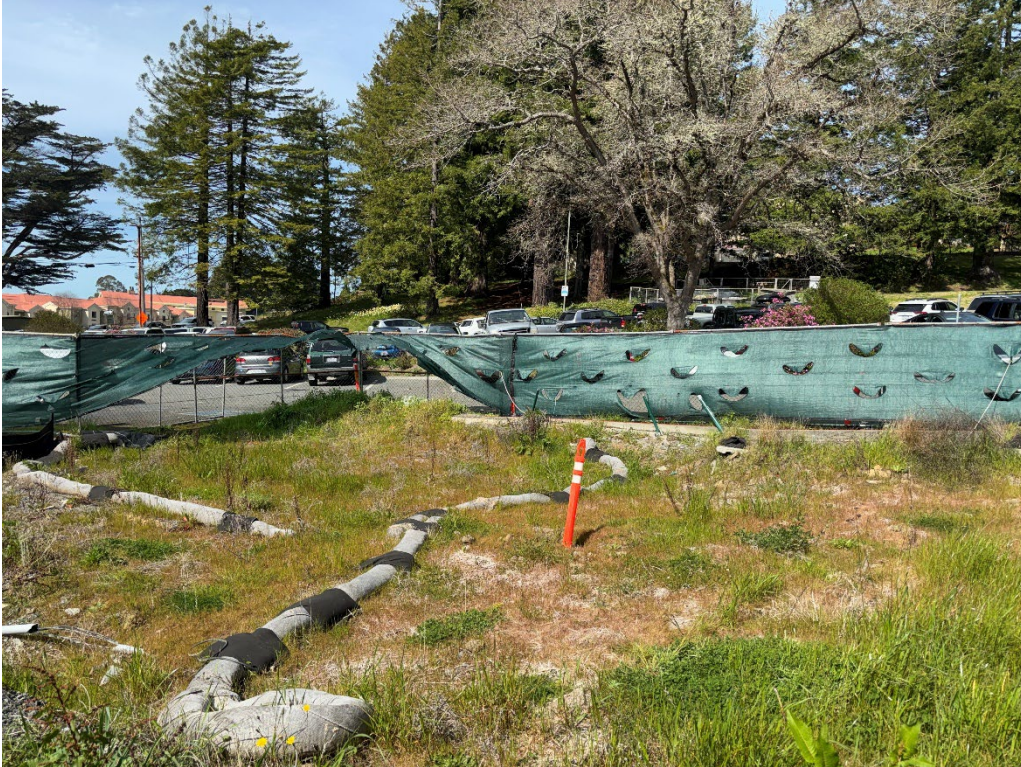
Photograph 7 – G14 vacant lot northwest corner – view looking northwest