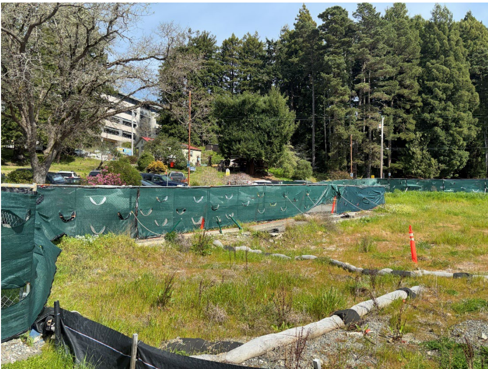
Photograph 4 – G14 vacant lot north curb – view looking northeast