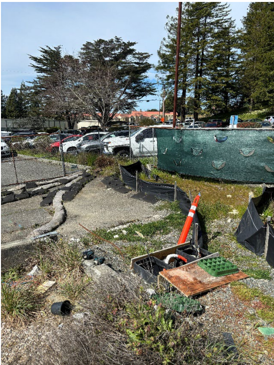
Photograph 6 – G14 vacant lot at Marcom driveway – view looking northwest