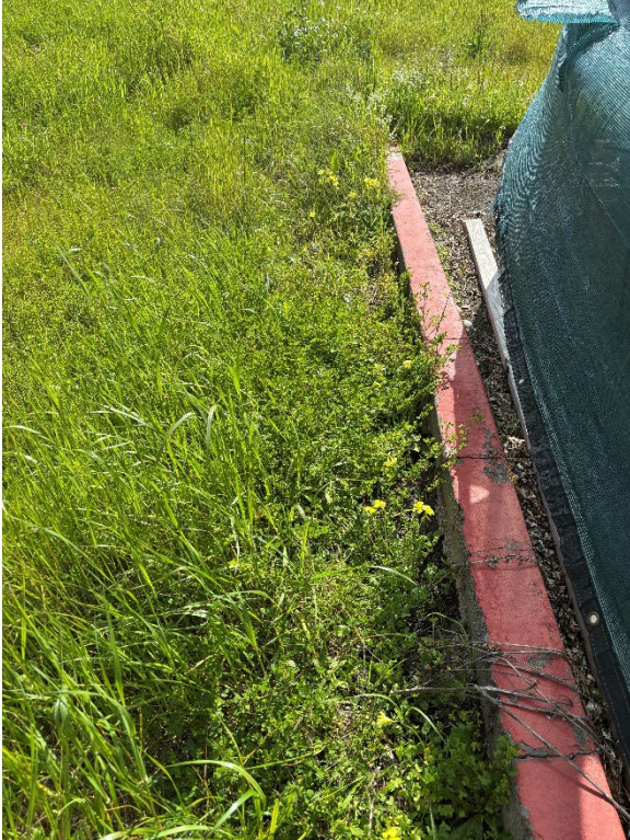
Photograph 5 – G14 vacant lot northwest curb – red paint (typical) contains lead – view looking south