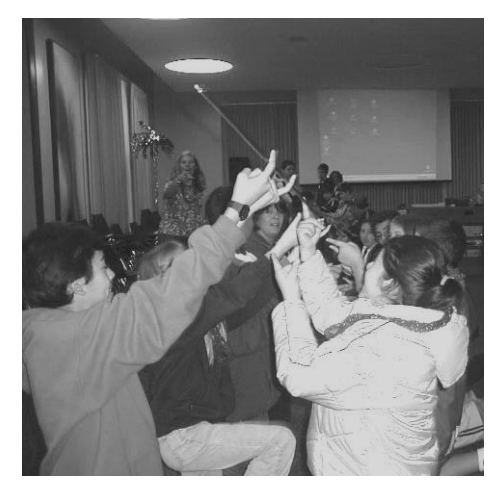
Team building games are fun!

Participants gained knowledge, shared information, played games, took tours, created art and fun, and ate a whole lot of ice cream. This social gives event