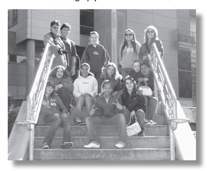
Peninsula Union Elementary School students on HSU campus tour

Students often hear teachers, counselors and Talent Search advisors talk about what college is like – the exciting opportunities on campus, the freedom of setting up your own schedule, no bells