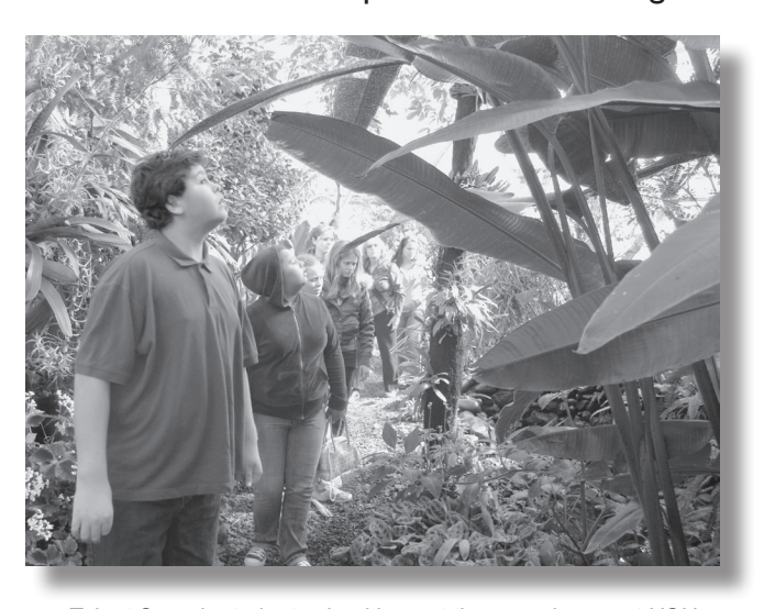
Talent Search students checking out the greenhouse at HSU

When Talent Search students visit HSU, they are dazzled by the wild animals in the game pens and the exotic birds and the large stuffed animals in the Wildlife Museum. They try out the pedal-powered blender and TV at the Campus Center for Appropriate Technology. They experience different climates in the various plant rooms in the green-