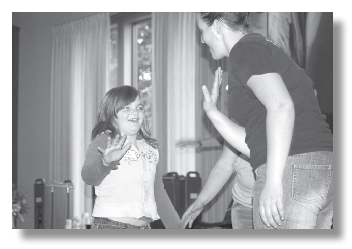
Family fun at the Talent Search Ice Cream Social

Participants at this year's Ice Cream Social went home informed and inspired to reach their college goals.