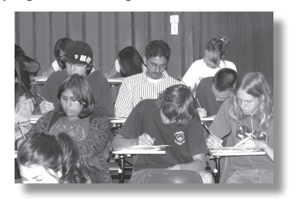
Talent Search students preparing for the 2007 SAT/ACT

So, if you're a junior or senior, mark your calendar for the end of September 2008. Attend this very important test orientation workshop and give yourself the edge. You've got nothing to lose and only higher scores to gain.