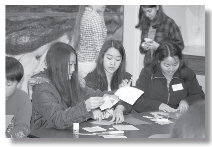
Students crafting Valentine cards for hospitalized U.S. veterans

Parents who wanted more information about the classes their students will need to take to be accepted to a four-year college or university were