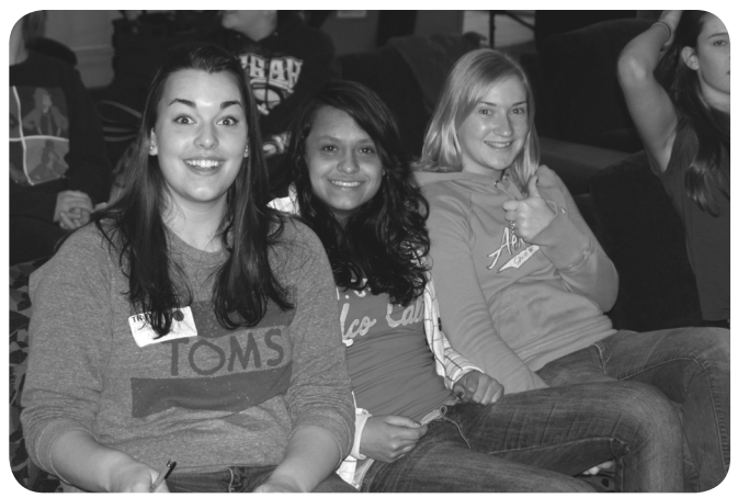
Students attending the SAT workshop

Being a part of the HSU Talent Search TRiO program, allows me to take advantage of the many benefits it has to offer. Recently, I attended the SAT Prep course Talent Search offered to all of the high school juniors, not only those who are a part of this program, but all who attend Humboldt County high schools. A few of my friends and I went to HSU one day during school to attend this workshop. We began with a short test from previous SAT tests, afterwhich we split into small groups and went to class! The two classes I attended were very beneficial: one was registering for the SAT; Talent Search gave us all a fee waver, so it was free; unfortunately I had already registered and missed out on the "free" aspect of the test. The other class I took included general information about the SAT (i.e. how many sections, time per question, and how to pace yourself depending on the difficulty of the question), and ACT tests. These two classes helped tremendously on the SAT, which I recently took.