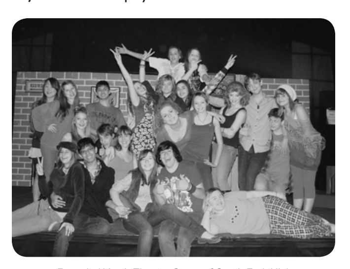
Recycled Youth Theatre Group of South Fork High

Being part of Recycled Youth - a free after-school teenage theatre program sponsored by Mateel Community Center in Redway, CA. has been an unforgettable experience for me. Every year, the objective of our plays have been to raise aware-