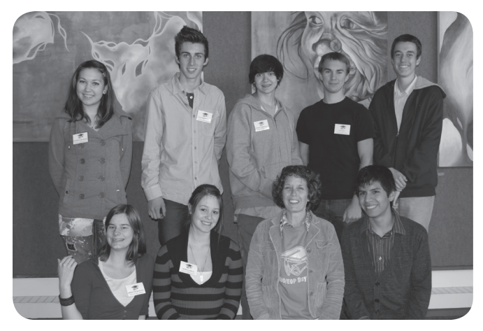
South Fork High TRiO Elective Seniors

The Talent Search and Upward Bound programs at Humboldt State University have teamed up with local high schools to implement a revolution in TRiO programing: The TRiO Elective! The TRiO Elective is part of a concurrent enrollment program with College of the Redwoods, BYU, Santa Barbara City College and other participating community colleges.