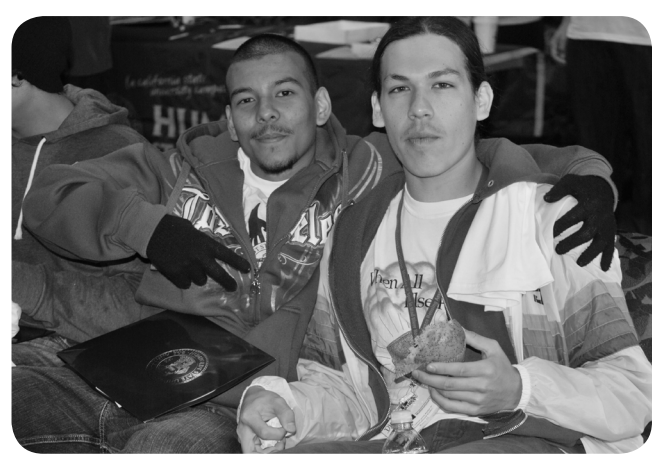
Student and mentor at HSU Latino Mentor Day

On Thursday, November 18, 2010 over 100 students showed up bright and early to take part in the 2<sup>nd</sup> Annual Latino Mentor Day. Talent Search, the Multicultural Center, and various HSU student led organizations came together to host this great event; in hopes of motivating Latino students to further their education after high school. Students from Arcata, Eureka, Fortuna, South Fork, and East Highschools took part in the various workshops and activities that were set up throughout the day.