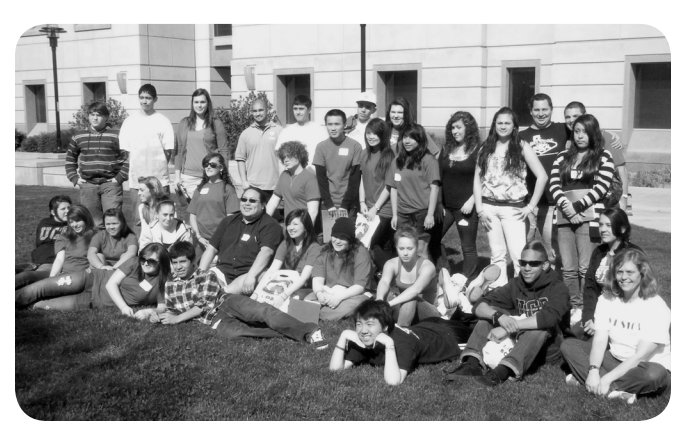
Student Leardership Conference attendees at UC Davis

The conference itself was very educational. I had the opportunity to meet students from all over Northern California who enjoyed being leaders and experiencing new things. The most challenging part of the whole trip was opening up to people in our small groups and letting people into our lives, if