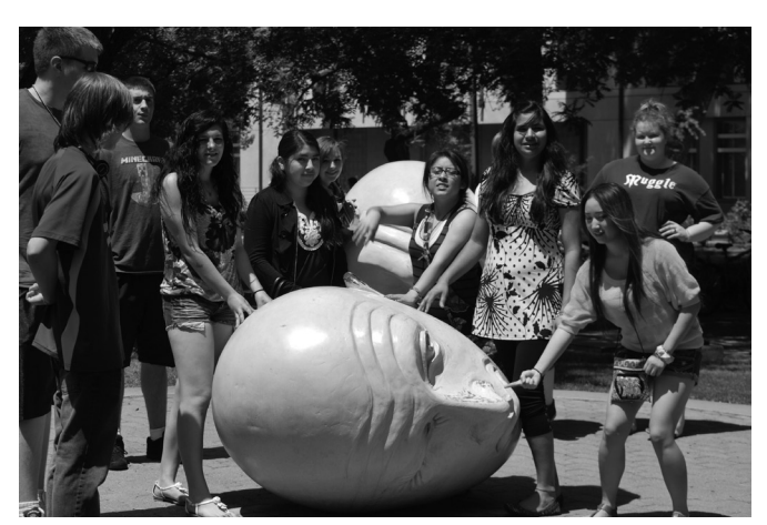
Talent Search at UC Davis

"The trip gave me the opportunity to explore more colleges than I thought I would ever have. I learned so many things like the programs the different colleges offer. It was such a great experience and we had so much fun!"