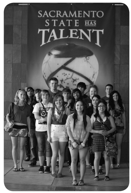
Talent Search students at Sacramento State

"I am grateful to Talent Search for giving me the great opportunity to visit and learn about more colleges. Now, because of Talent Search, I am focusing on my career by getting more information from them. This is the only program that helps us get to know more about colleges. I loved everything about the trip & meeting new people."