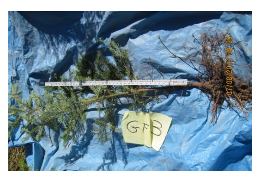
Excavated seedlings, which was measured, photographed, weighed, dissected, and then oven-dried on campus

In addition to their other duties, the Tree Farm summer crew is getting more involved in faculty research. In summer 2013, the crew started a multiyear project designed by Professor Pascal Berrill. The goal is to identify factors affecting root mass and root:shoot ratio in planted seedlings of different ages and species. The "Root:Shoot Biomass Matrix Study" involves repeatedly (annually), measuring and digging up seedlings of different species, planted in different years in replicated row-plot plantings (established by the FOR 432 Silviculture class each winter), after recording how much browsing they had sustained and which weed species they were competing with, etc.