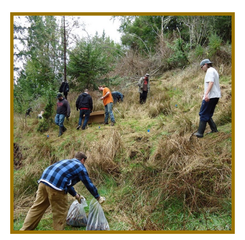
Looking for favorable microsites to plant seedlings on steep, dry slope.