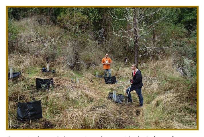
Improvised tree shelters oriented to provide shade from afternoon sun.