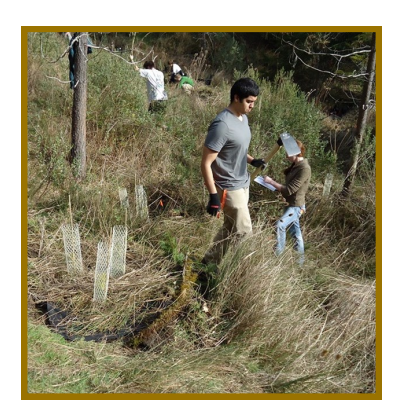
Hand cut terrace, berm, and mulch to enhance survival, and cluster planting to ensure stocking under expectation of high mortality in dry spot.