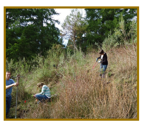
Testing innovative approaches to restoration on drought-prone sites: planting in auger bore holes to promote rapid taproot extension on dry site, and cutting 'light well' openings in the poison oak to plant trees amongst the partial shade provided by the vines.