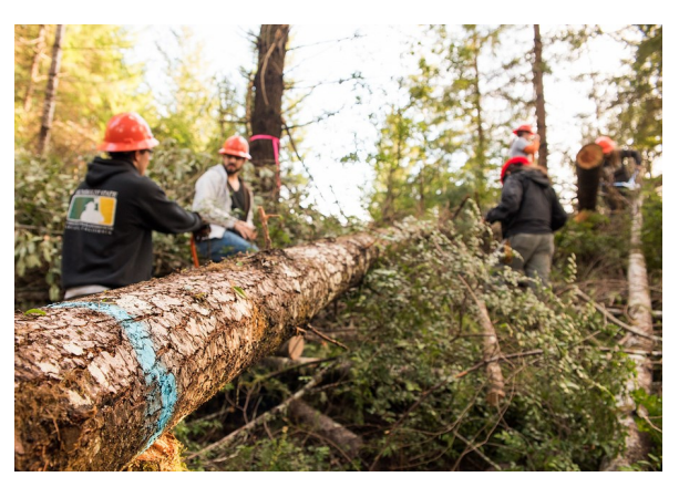
Students in FOR 432: Silviculture help implement the variable density retention experiment

The project will foster strong collaborative relationships amongst the faculty of the Department of Forestry and Wildland Resources, leading to continued research and outreach efforts of societal importance. The research and training provided by this project will also benefit the graduate and undergraduate students working on the project. Two graduate students in the Forest Watershed and Wildland Science option of the Masters of Natural Resources at Humboldt will also receive training and research experience, basing their theses on parts of this project. In addition to receiving funding support from the Tree Farm funds this project is also being supported by funding through the McIntire-Stennis (M-S) Cooperative Forestry Research Program grant.