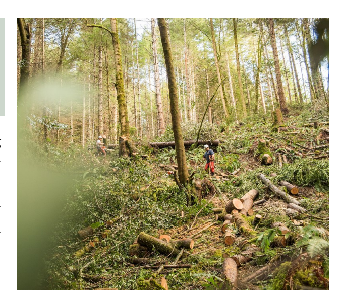
Students in FOR 432: Silviculture helping implement the variable density retention experiment