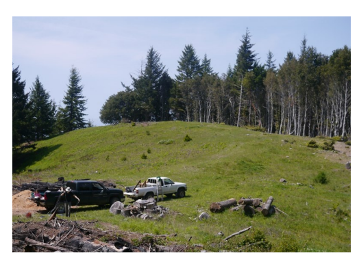
Study site at the Tree Farm

The project began in June of 2014 with the researchers making trips to Petrolia and the Schatz Demonstration Tree Farm to locate study sites for the experiment and identify suitable trees. The weather station was overhauled at the Tree Farm to begin collecting weather data. During the fall the study