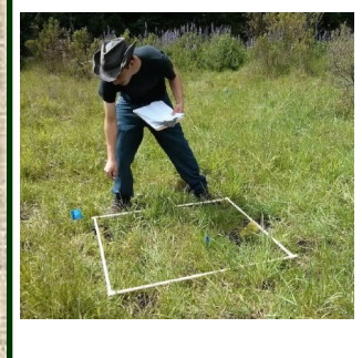
Student in FOR 431 measuring species richness and composition as part of their forest restoration project.

Forestry and Wildland Resources Faculty will commence a multi-year, collaborative project examining the impact of variable-density Retention in Evergreen Mixed-conifers on carbon storage, water use and regeneration.