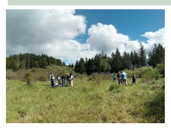
Students in FOR 431 work on their restoration project at the Tree Farm.