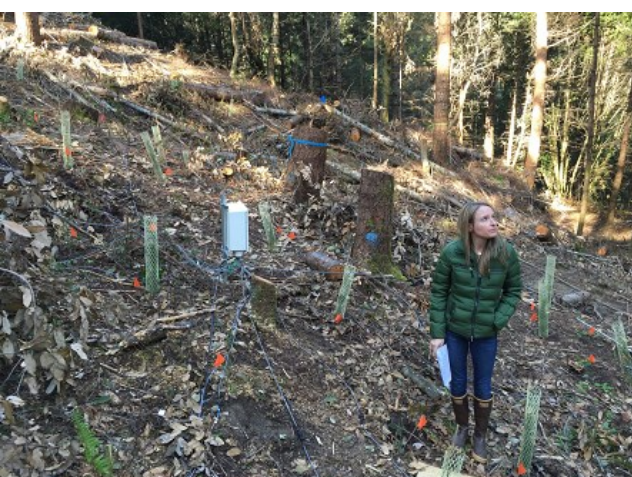
Dr. Lucy Kerhoulas at the variable density study site

The project will wrap up in 2017 with additional monitoring of planted seedling growth and manual weed control to maintain the experiment. The data collected will be analyzed by the researched with the findings published and presented at meetings.