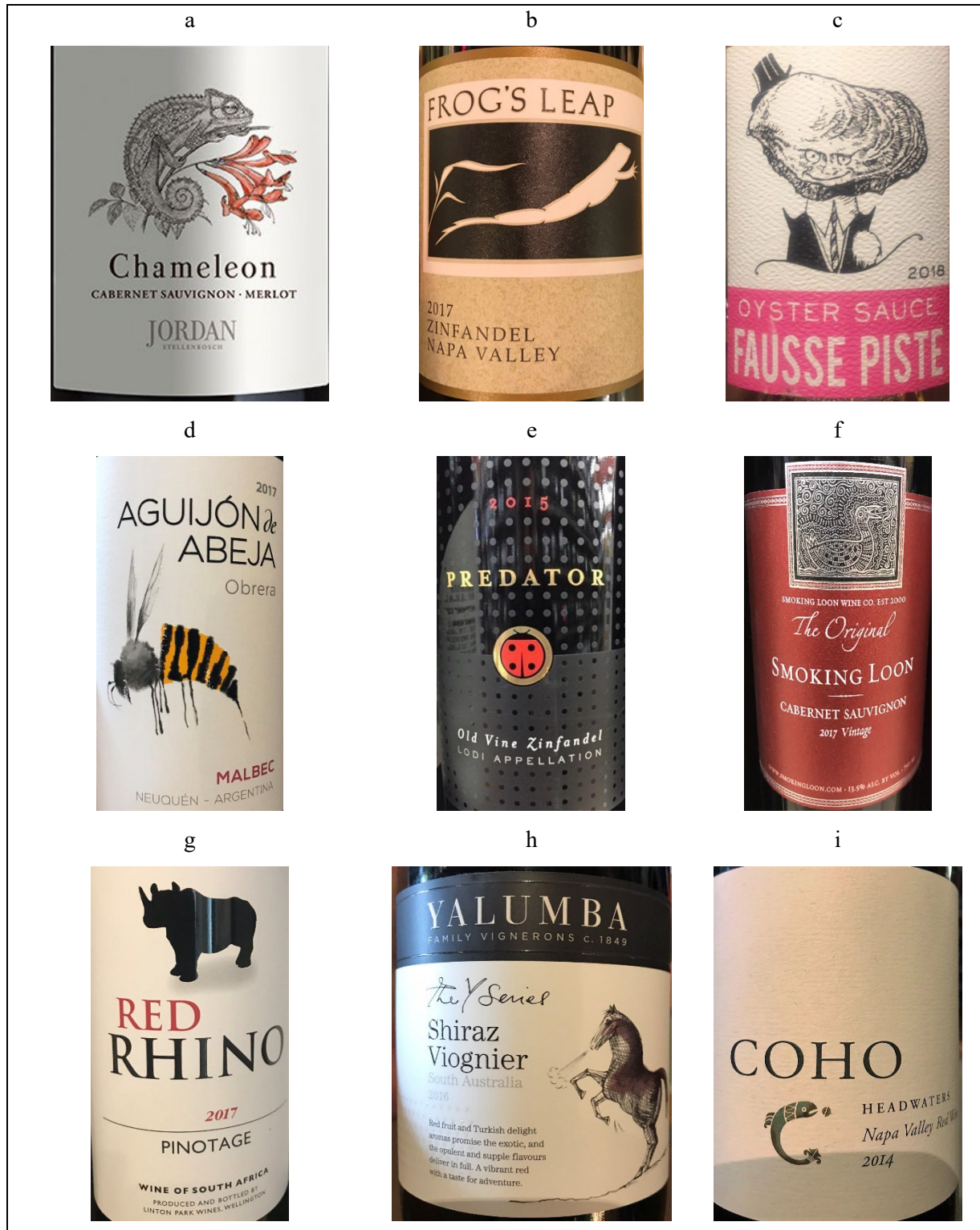
Note: Labels were categorized as realistic (a), generalized (c, e, h), silhouetted (b, g), and abstract (d, f, i), and from several types of animals, including birds (f), mammals (g, h), reptiles (a), amphibians (b), fish (i), insects (d, e), and other invertebrates (c).