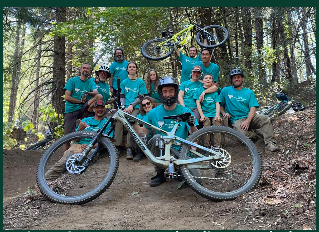
Redwood Coast Mountain Bike Association